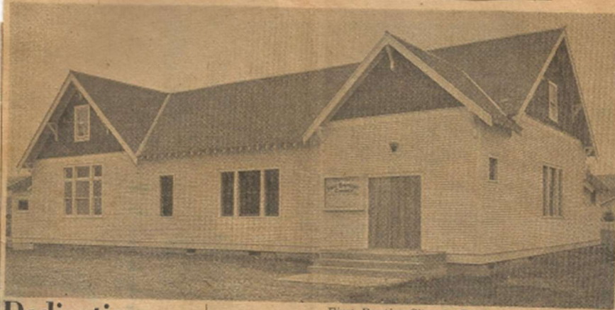
First Baptist Church, Polson