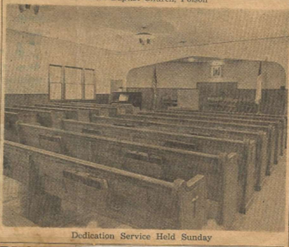
Dedication Service Held Sunday