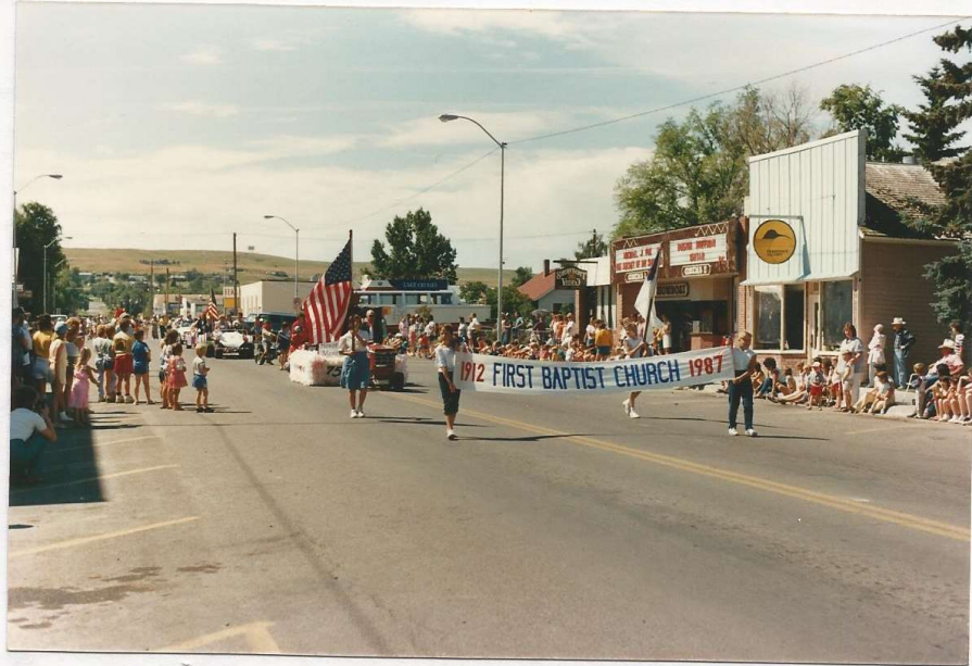
First Baptist Church parade entry.