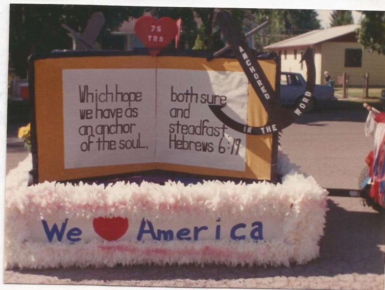
Scripture verse on First Baptist Church float 7/4/1987