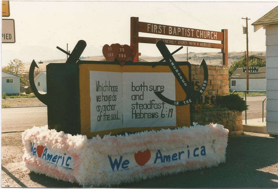
Float for the 75 th Anniversary parade