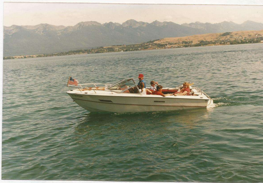
Don Link & boat at picnic for 75 th Anniversary