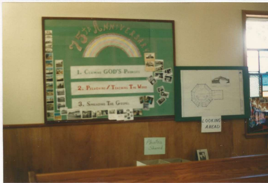
Church wall decorations for 75 th Anniversary