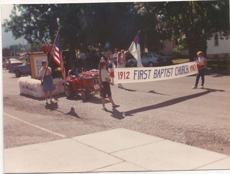
First Baptist Church exhibit In July 4 th 1987 parade