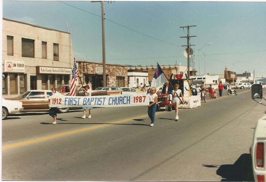
First Baptist church float on 2 nd St. E