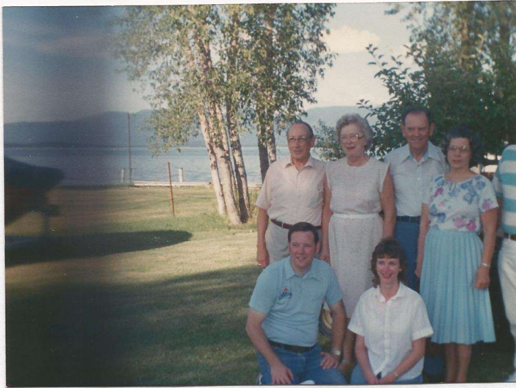
Burman's, Buerer's and Ringhoffs