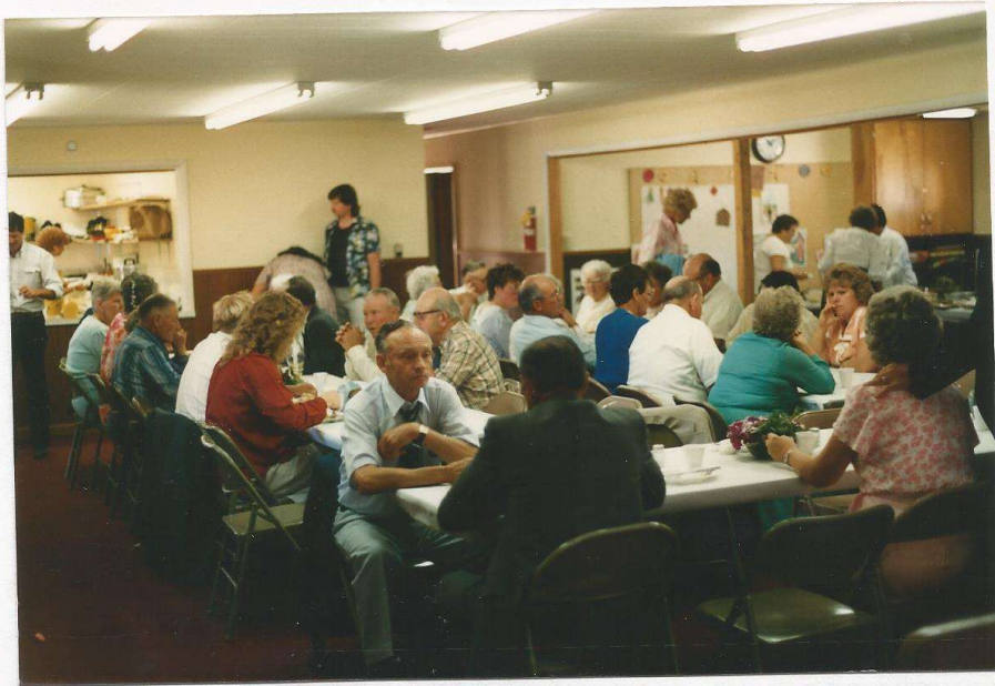
Dinner at 75 th anniversary