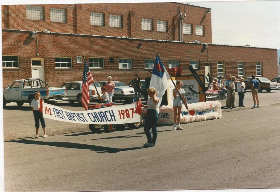
Float beside Linderman gym